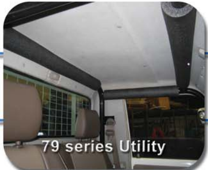
79 series Utility