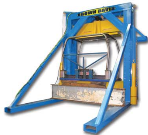
Brown Davis physical test rig

Brown Davis ROPS exceed the strength standards and are designed to comply with all the new proposed registration requirements within Australia (eg. LK8 / LH9 in Queensland).