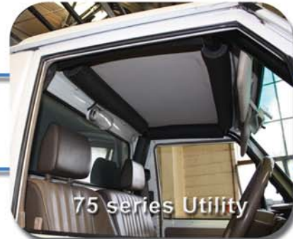
75 series Utility