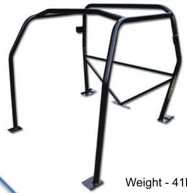
Weight - 41kg

Each ROPS design is engineered to exceed the most stringent standards of the worlds major resource companies (eg. Anglo American). Testing is carried out in line with the new RMA International Mining ROPS Protocol (world leading commercial vehicle ROPS safety requirements).