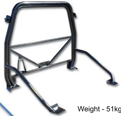
Weight - 51kg

Each ROPS design is engineered to exceed the most stringent standards of the worlds major resource companies (eg. Anglo American). Testing is carried out in line with the new RMA International Mining ROPS Protocol (world leading commercial vehicle ROPS safety requirements).