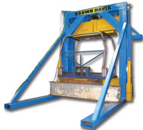
Brown Davis physical test rig

Brown Davis ROPS exceed the strength standards and are designed to comply with all the new proposed registration requirements within Australia (eg. LK8 / LH9 in Queensland).