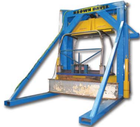
Brown Davis physical test rig

Brown Davis ROPS exceed the strength standards and are designed to comply with all the new proposed registration requirements within Australia (eg. LK8 / LH9 in Queensland).