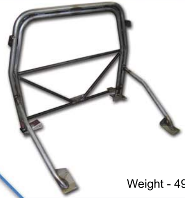
Weight - 49kg

Each ROPS design is engineered to exceed the most stringent standards of the worlds major resource companies (eg. Anglo American). Testing is carried out in line with the new RMA International Mining ROPS Protocol (world leading commercial vehicle ROPS safety requirements).